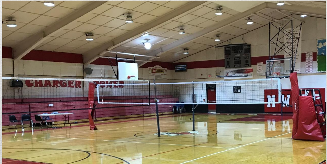
New Gym Bleachers