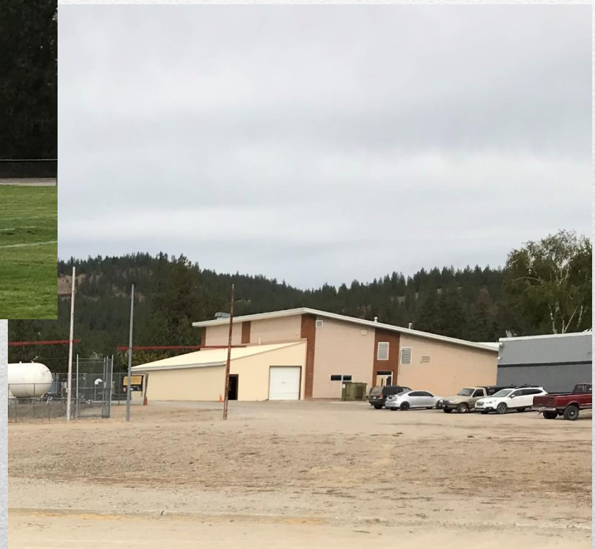
Expand Wood/Metal Shop Building