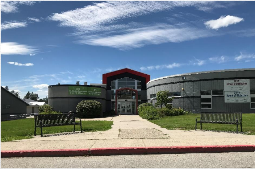
Secure Building Entries