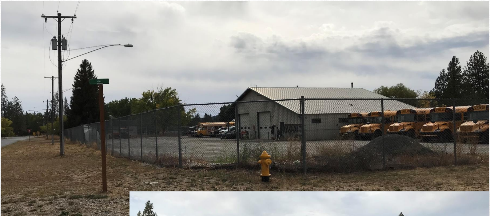
Additional Covered Bus Storage