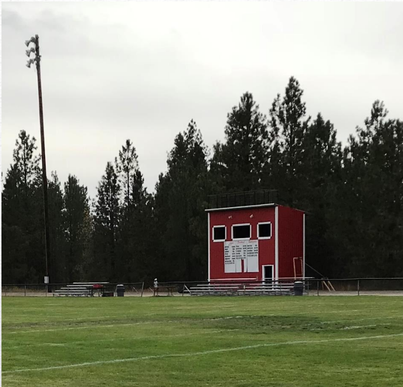
New Field Bleachers